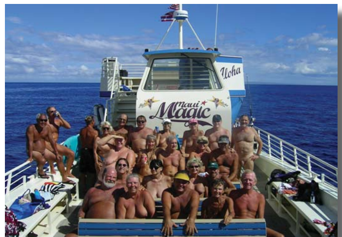
July 2005 Cruise